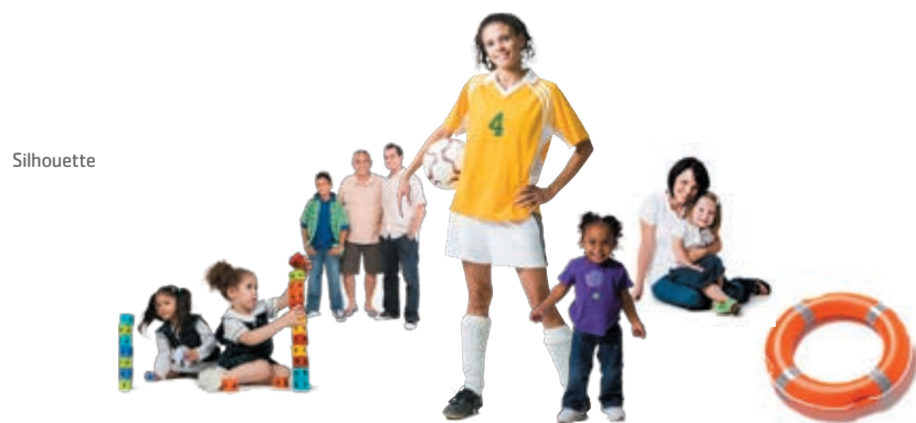
Image with a background

Images used in Y collateral should strike an emotional chord and show our role in communities. Our primary imagery is silhouette. When necessary images, with backgrounds may be used to tell our story—just make sure the background is simple and has a corner radius of 0.17". From time to time, simple illustrations (not clip art) may be used.